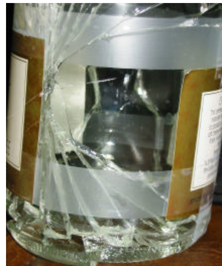
BOTTLE AFTER BURSTING

In order to reduce the level of risk and injury associated with the improper handling of sparkling wine bottles, a number of wine companies have placed warning labels on their sparkling wine bottles and shippers. These companies asked the Winemakers' Federation of Australia (WFA) to develop standard warnings for adoption by all Australian wine companies at their own discretion.